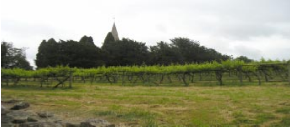
Forthill Gifford Vineyard

Concerns were expressed throughout the consultation process about the future of farming in the area. Nearly 6% of the local workforce is in agriculture and the Action Plan supports the principle that the industry has a continuing role to play in maintaining the countryside on which much of the area's appeal and tourism economy relies.