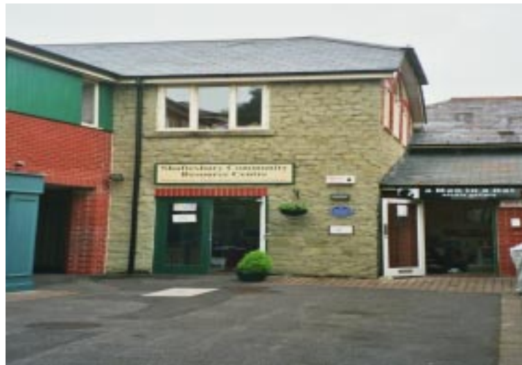
Swans Yard Community Office

and community groups. This will enable them to come together to have a voice in decision-making in strategic partnerships across Shaftesbury area and, in particular, assist them to secure appropriate resources to develop their own structures and projects.