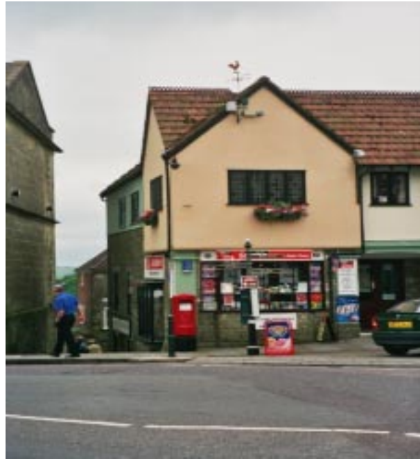
Entrance to Gold Hill

The Action Plan supports the objectives within the SDCC's 'Policy and Strategy Statement 2005-2020' and will work to assist the SDCC in developing schemes and initiatives which forward and help to realise these economic objectives.