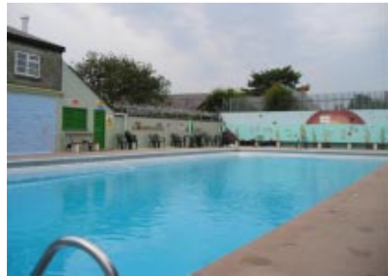
Shaftesbury Swimming Pool

In addition, the lack or inconsistency of public transport makes it difficult or impos-